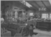
Shabby chic life

For a referral to a decorator who is available for consulting or a complete home installation, call Nona Green at 949-426-2292.