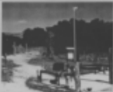
Open for riding